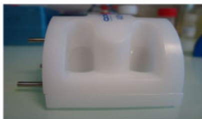
MODULO Brick (# 20108)